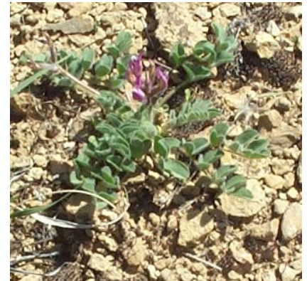
Holmgren milkvetch plants only live for 2-3 years and need specialized habitat.