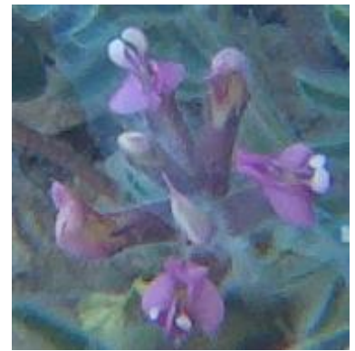
Holmgren milkvetch, a Mojave Desert member of the Pea Family, has attractive white-tipped purple flowers.