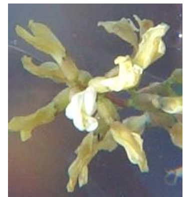
Shivwits milkvetch, also a member of the Pea Family, has nice yellow flowers.