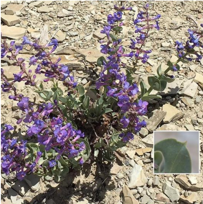
Penstemon pachyphyllus var. mucronatus , thickleaf penstemon, showing leaf tip.