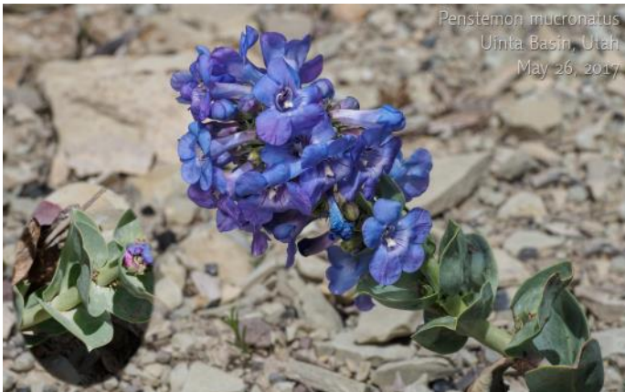
Penstemon pachyphyllus var. mucronatus, closeup.

and we learned a lot about the plants and their habitats. And best of all, it was fun to hang out with a bunch of people who liked them as much as we did.