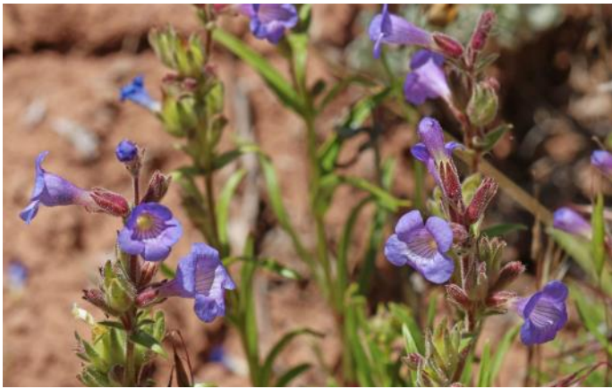
Penstemon goodrichii , Goodrich penstemon.