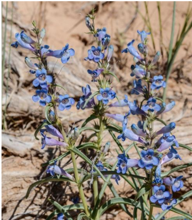
Penstemon angustifolius var. vernalensis , narrowleaf penstemon.

Here we took turns prostrating ourselves to the miniscule Penstemon caespitosus var. caespitosus , cameras of all varieties contorted in various positions. The perfect definition of a "belly plant," it is just about as fine a rock garden plant as one would ever want to grow, with fine needle-like leaves and blue-violet flowers emerging directly from the mat. How many pennies have been posed next to those plants for scale, one would wonder. The same hillside also hosted Penstemon humilis .