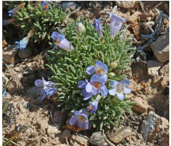
Penstemon acaulis , stemless penstemon.