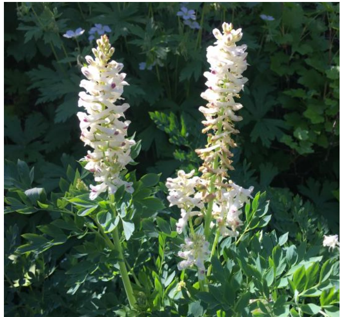
Beautiful Corydalis caseana ssp. brachycarpa .

The temperatures in the Salt Lake Valley topped out at 99 degrees again that day, another hot one in a string of sizzlers,