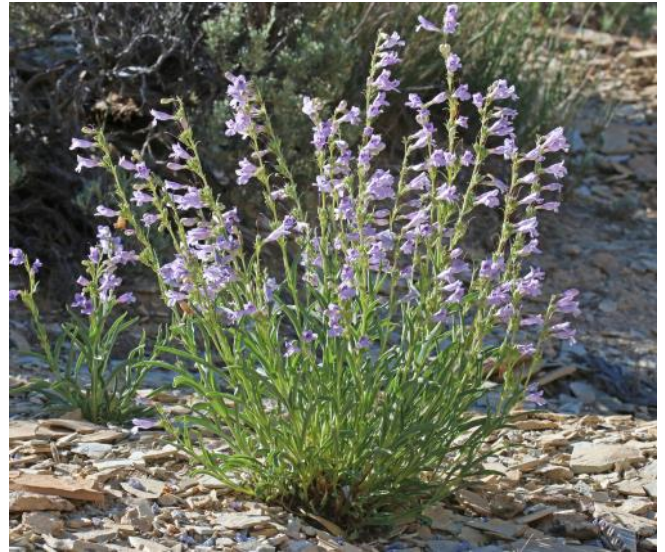
Penstemon albifluvis , syn. P. scariosus var. albifluvis (White River penstemon) South of Vernal. Closeup photo by Richard Jonas. Whole plant photo by Andrey Zarkikh.

endemic was Penstemon grahamii , which also lives on shale in difficult growing conditions, but was, unfortunately, past peak bloom. We were lucky to find one plant with three perfect flowers, but what a lovely plant it was. The next day, the other group found more plants with new blooms.