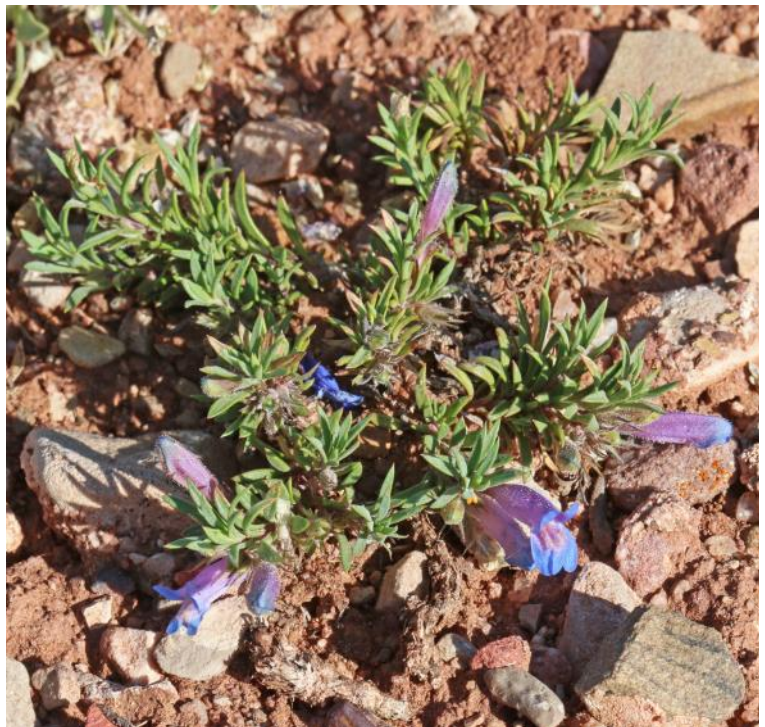
Penstemon caespitosus var. caespitosus , mat penstemon.