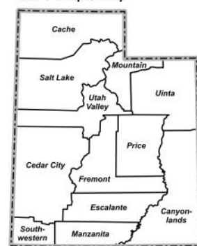
UNPS Chapter Map

At the UNPS website you can access the Sego Lily in color, download past issues, read late breaking UNPS news, renew your membership, or buy wildflower posters, CDs, and other stuff at the UNPS store. unps.org