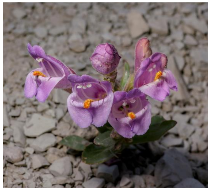
Penstemon grahamii, Graham penstemon.