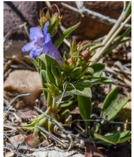
Penstemon duchesnensis, Duchesne penstemon.