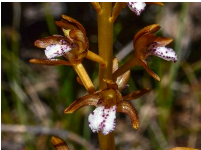
Figure 5. Spotted coralroot ( Corallorhiza maculata ).