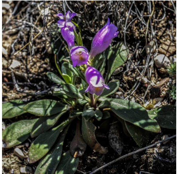
Penstemon eriantherus var. cleburnei , fuzzy-tongue penstemon.