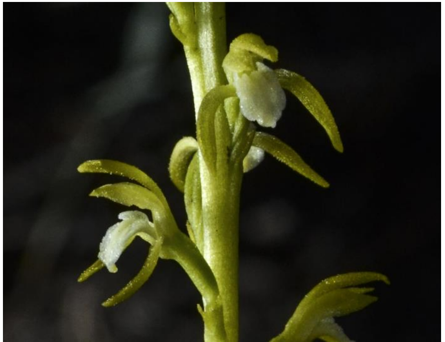
Figure 2. Early coralroot ( Corallorhiza trifida ) flower.