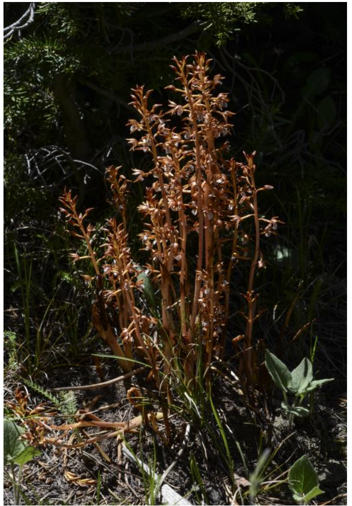
Figure 4. Corallorhiza maculata .