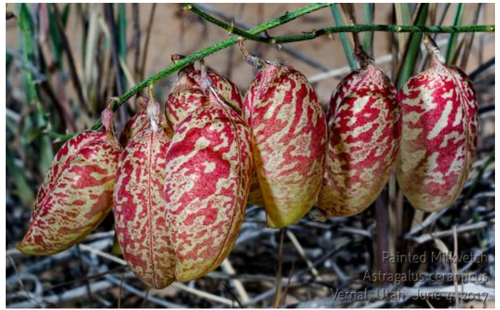
Astragalus ceramicus, the painted milkvetch.