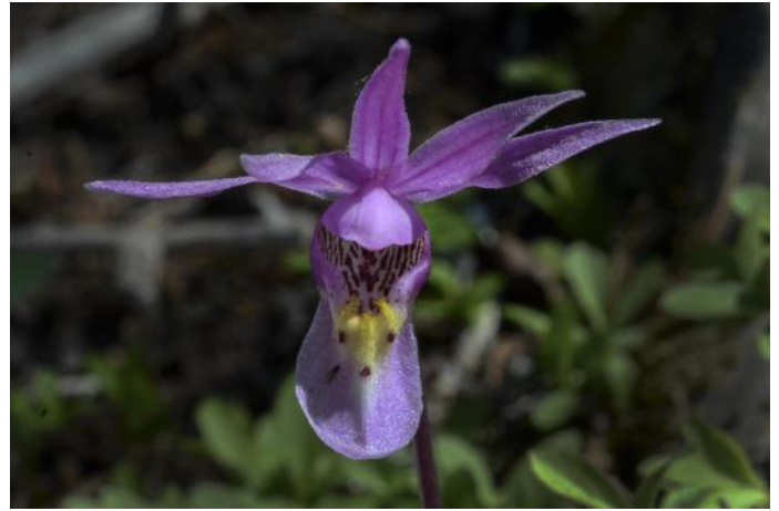
Figures 7 and 8. Calypso Orchid ( Calypso bulbosa )

But then we came upon the pièce de résistance of our incredible day! With much anticipation, anxiety (Would it be in flower? Would those flowers be at their peak? Would our cameras be able to capture their beauty?) we came across the prize of the day. The Calypso Orchid ( Calypso bulbosa )! There it was! We were in our happy place! Marv had done his homework and found what turned out to be a needle in a haystack on a forested slope with only a few scattered plants! And they were in perfect shape! Yes!! This little beauty (Figures 7 & 8), while occurring through the Rocky Mountains and portions of the Pacific Northwest, as well as a few northern states and Canada, is rarely abundant and is a real treasure to see.