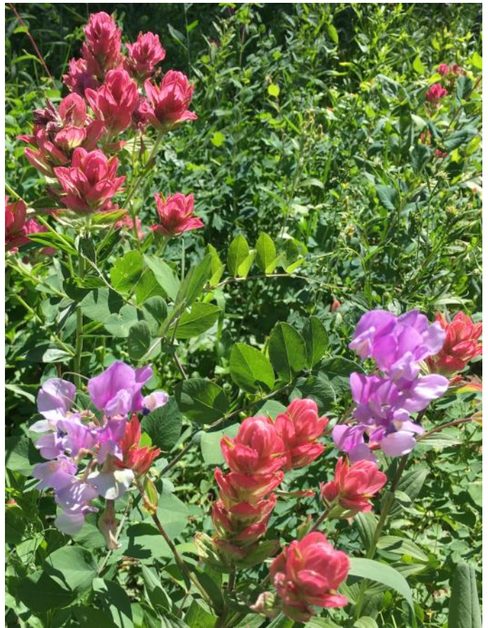
Paintbrush and pea. Castilleja rhexifolia and Lathyrus pauciflorus.