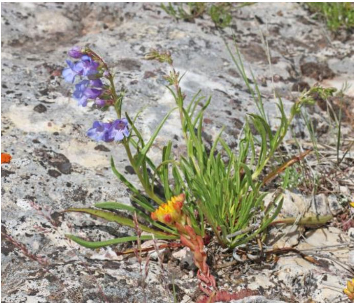
Penstemon scariosus var. garrettii.