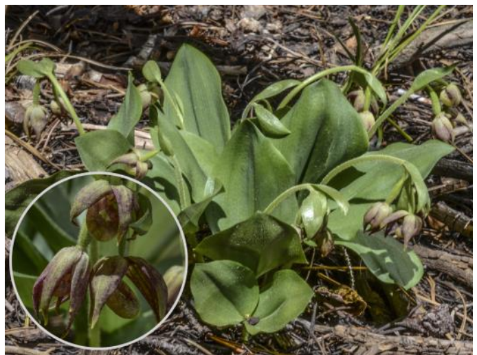
Figure 6. Brownie lady's slipper ( Cypripedium fasciculatum )