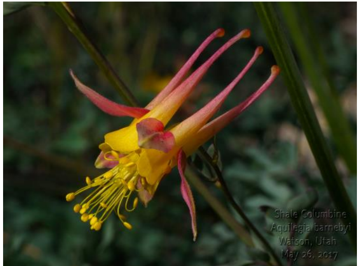
Aquilegia barnebyi.

and we learned a lot about the plants and their habitats. And best of all, it was fun to hang out with a bunch of people who liked them as much as we did.