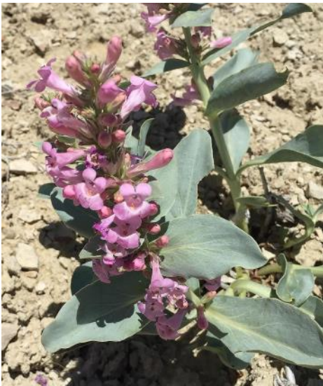
Penstemon flowersii , Flowers penstemon. Pre-conference photo by William Gray.