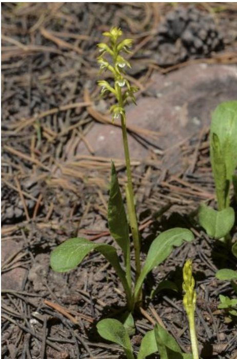
Figure 1. Early coralroot ( Corallorhiza trifida ) in the East Park Campground, Ashley National Forest.

Nearby was the relatively large-flowered (especially when