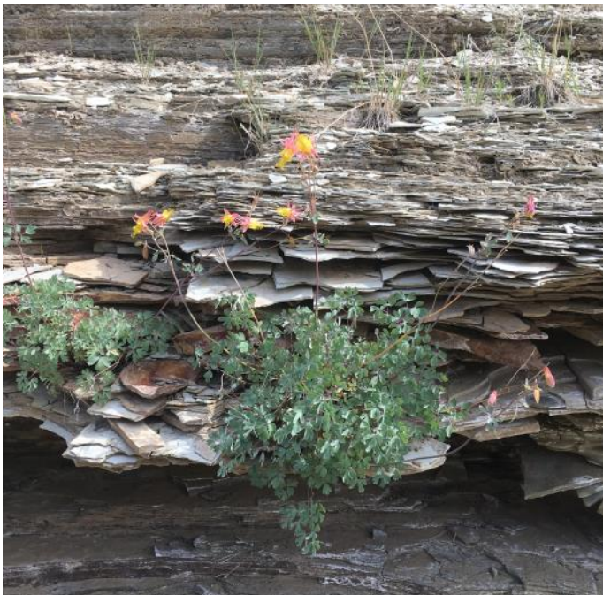
Aquilegia barnebyi , shale columbine.

Other plants of interest: Eremogone (Arenaria) hookerii ,