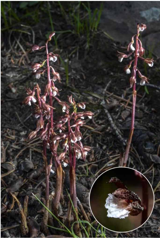
Figure 3. Spring coralroot ( Corallorhiza wisteriana ) also in the East Park Campground.