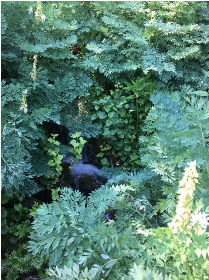
Wet soil and shade describe the habitat of Corydalis caseana ssp. brachycarpa .

columbianum (Western Monkshood). As we paused on the trail, Andrey Zarkikh commented to me on the lethal grouping of plants in front of us - veratrum, aconite and heracleum. We discussed the potential for the three as the plot for an Agatha Christie murder mystery.